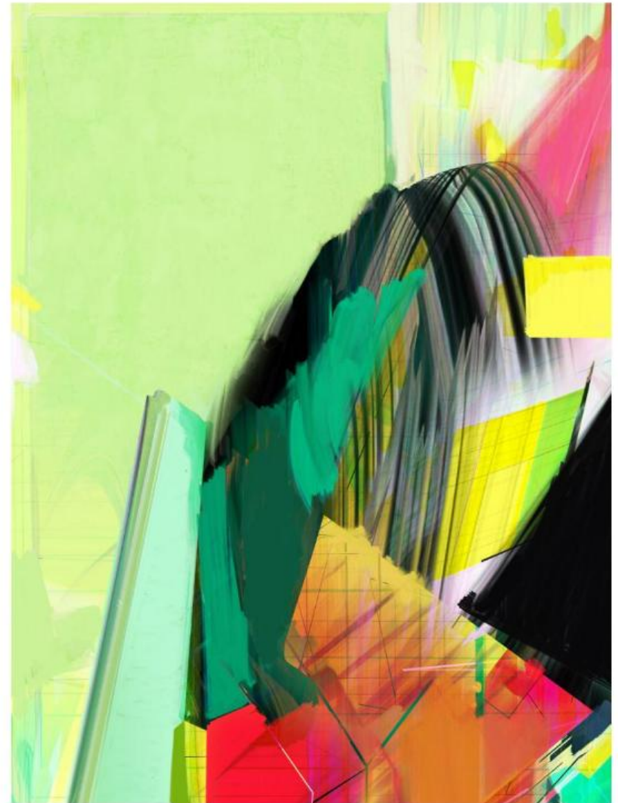
But Giclée print on Hahnemühle fine art paper mounted on dibond 120x90 cm 2021