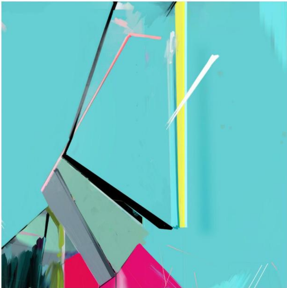
Splitter Giclée print on Hahnemühle fine art paper mounted on dibond 100x100 cm 2021