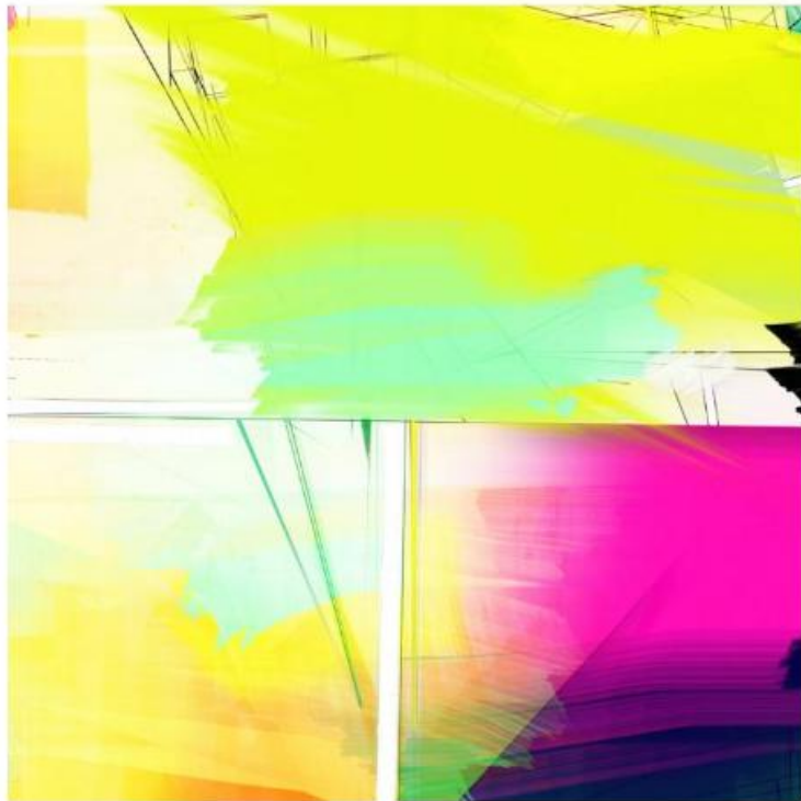
All the bridges Giclée print on Hahnemühle fine art paper mounted on dibond 120x120 cm 2021

Site: www.naezerka.com Email: info@naezerka.com Instagram: nae.zerka