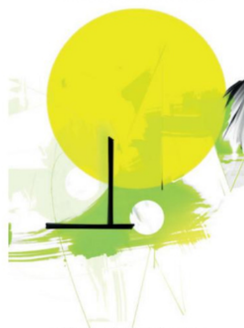
BALANCE1_4, 2021. Digital Painting, 65x45 cm.