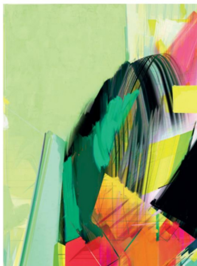
Top Left: SPLASH, 2021. Digital Painting, 100x100 cm.

He broke away entirely from the traditional materials of painting and began to paint purely digitally. A step that was ultimately necessary, however, in order to dive into digital painting with all consistency.