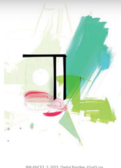
BALANCE1_3, 2021. Digital Painting, 65x45 cm.